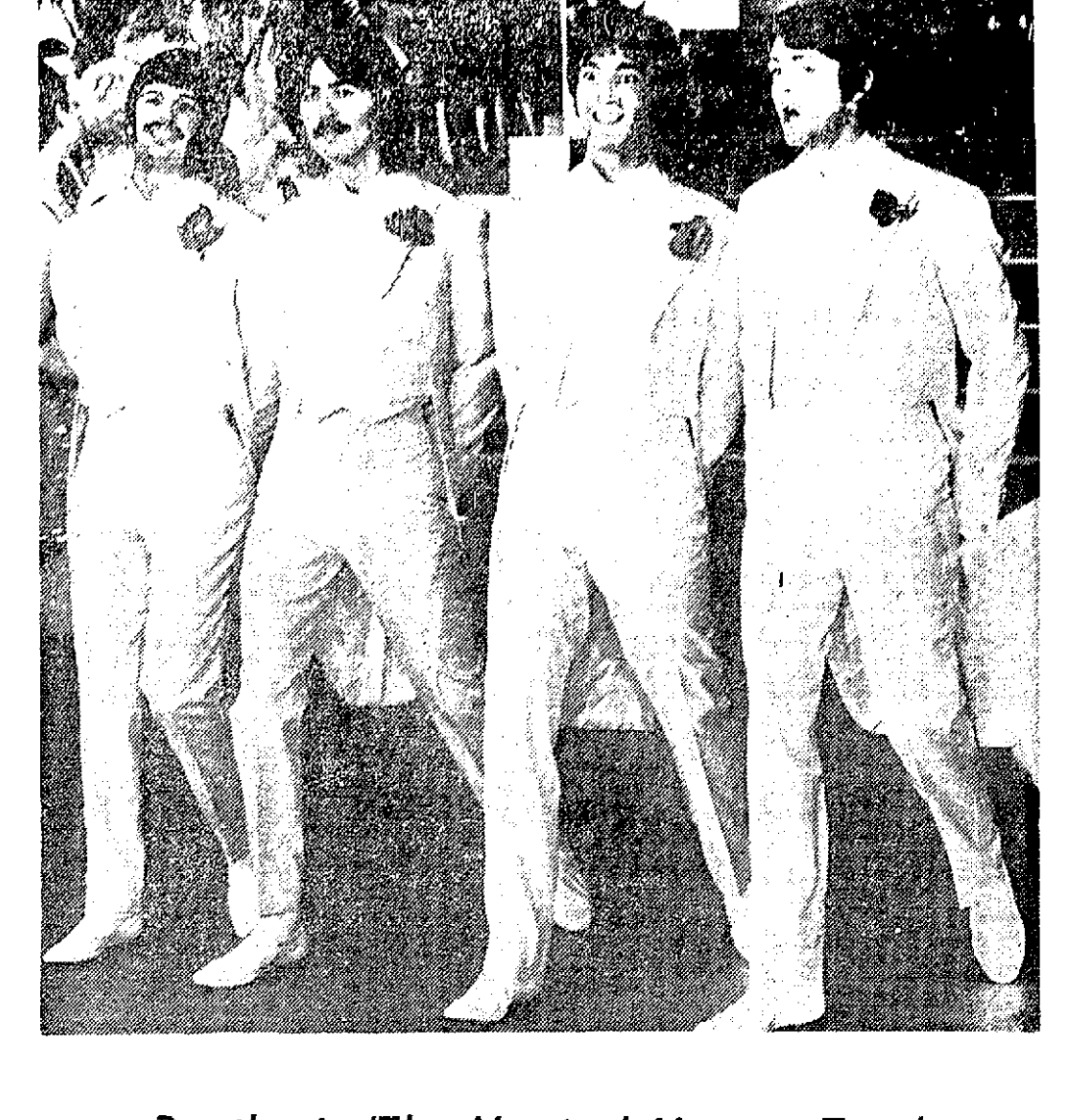
Beatles in 'The Magical Mystery Tour'

DEBBIE SEE, Columbia High junior: "You wouldn't be putting me on, would'ja?''